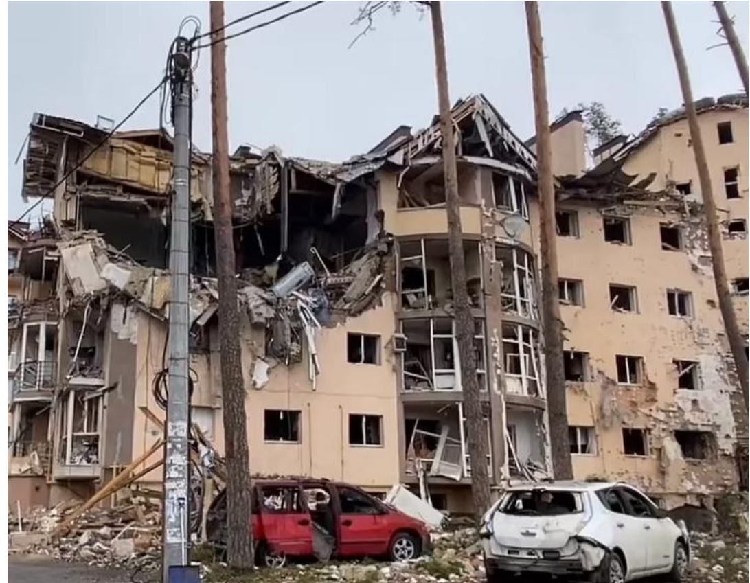
A residential building in the small town of Irpin, north west of Kyiv before and after it was hit in a Russian missile attack after Moscow's forces invaded Ukraine